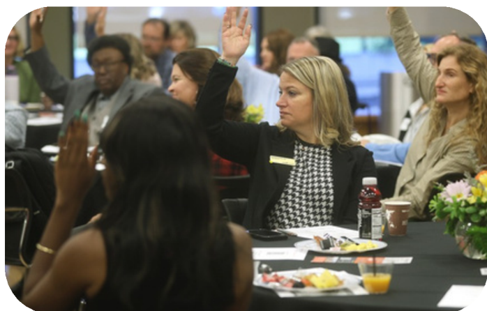
AppointedNKY Launch, October 2025.