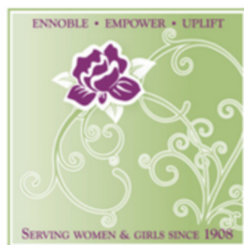
THE CHARLOTTE R. SCHIDLAPP FUND Fifth Third Bank, Trustee