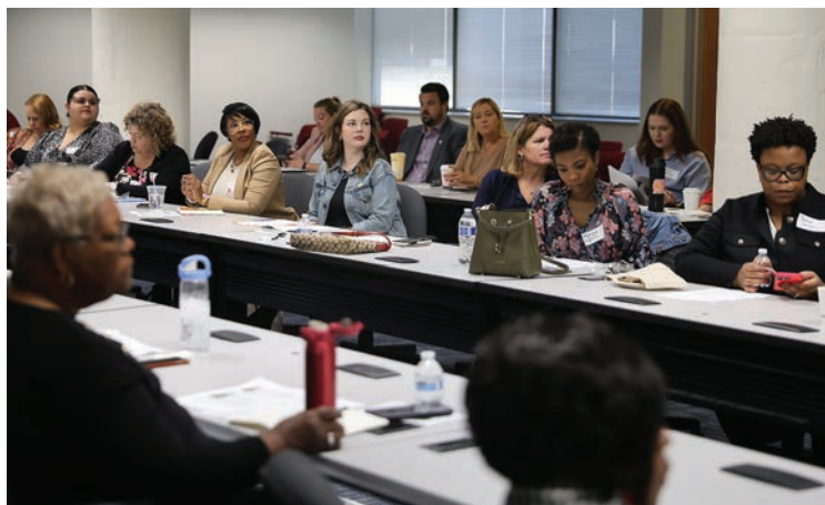
Educational Workshop 2024